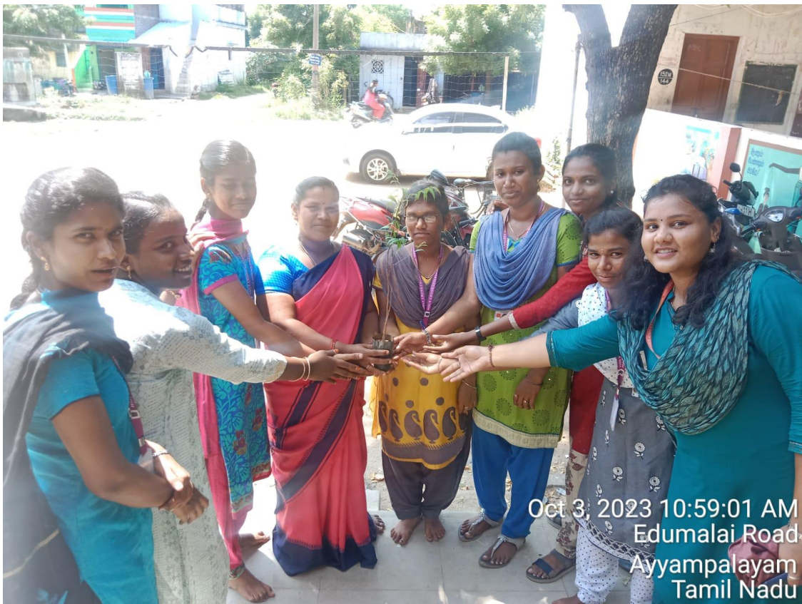
Oct 3, 2023 10:59:01 AM Edumalai Road Ayyampalayam Tamil Nadu