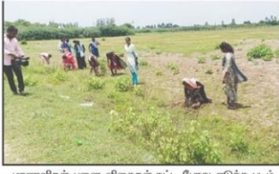
மாணவிகள் பண விதைகள் நட போது எடுத்த படம்.