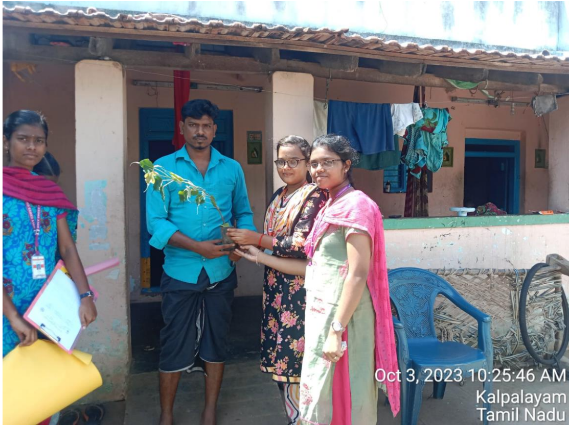
Oct 3, 2023 10:25:46 AM Kalpalayam Tamil Nadu