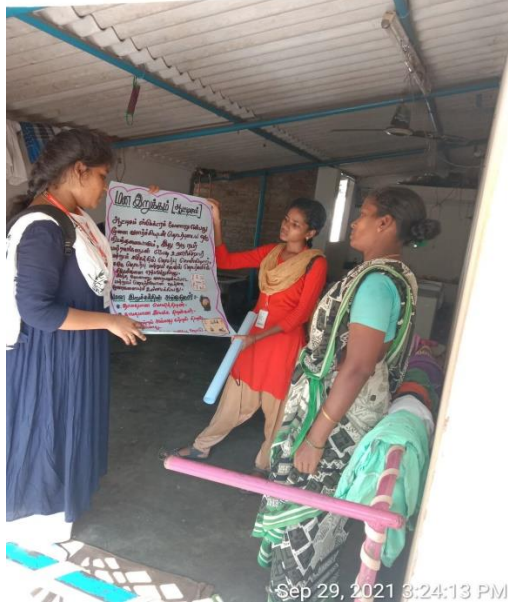
Sep 29, 2021 3:24:13 PM