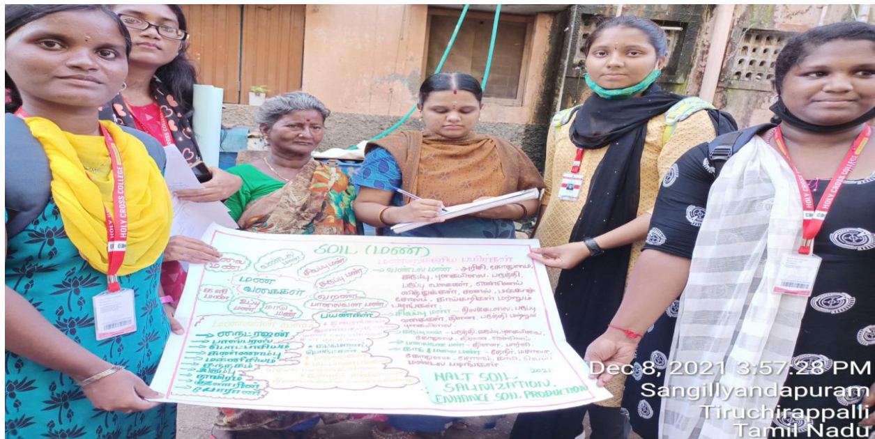
Dec 8, 2021 3:57:28 PM Sangillyandapuram Tiruchirappalli Tamil Nadu