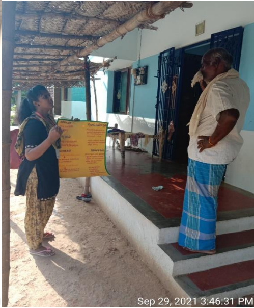
Sep 29, 2021 3:46:31 PM