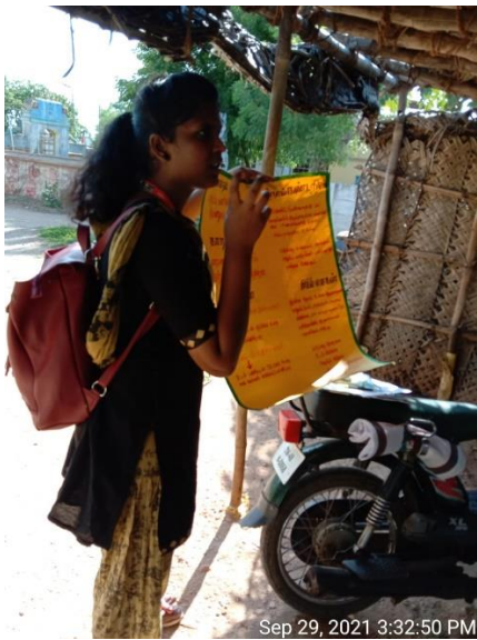
Sep 29, 2021 3:32:50 PM