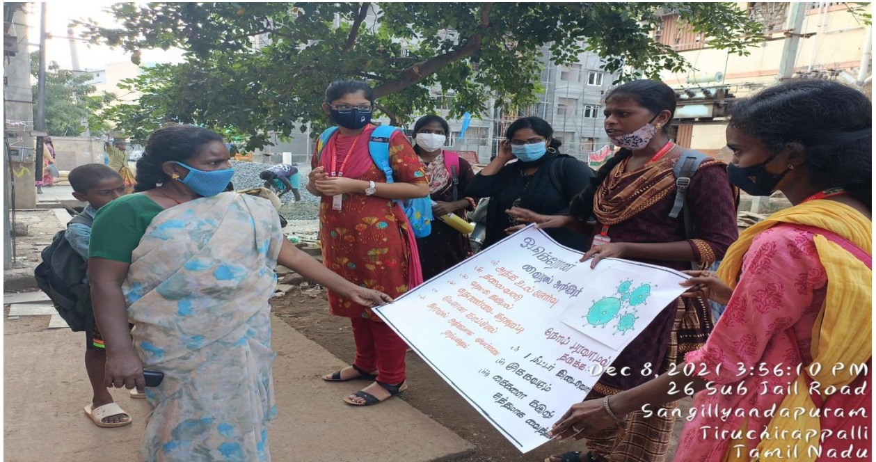
Dec 8, 2021 3:56:10 PM 26 Sub Jail Road Sangillyandapuram Tiruchirappalli Tamil Nadu