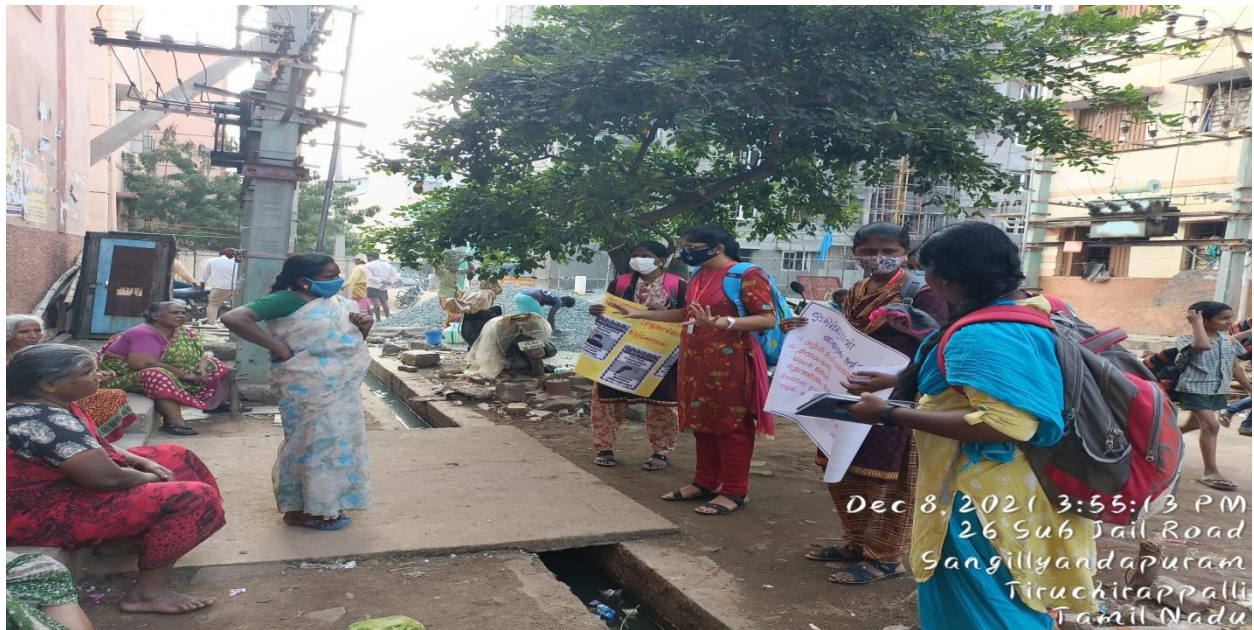
Dec 8, 2021 3:55:13 PM 26 Sub Jail Road Sangillyandapuram Tiruchirappalli Tamil Nadu