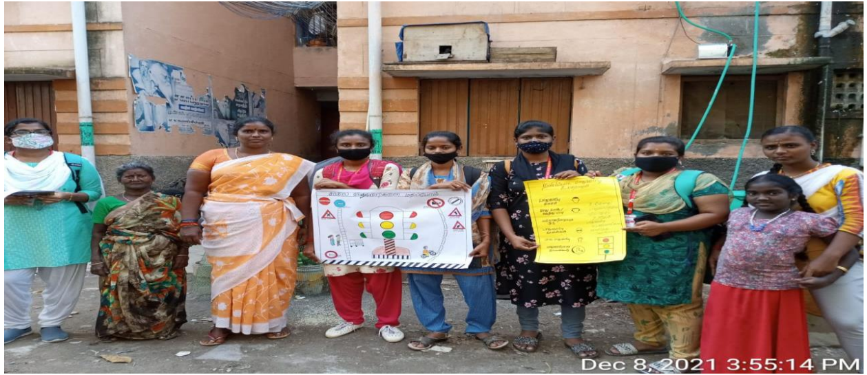
Dec 8, 2021 3:55:14 PM