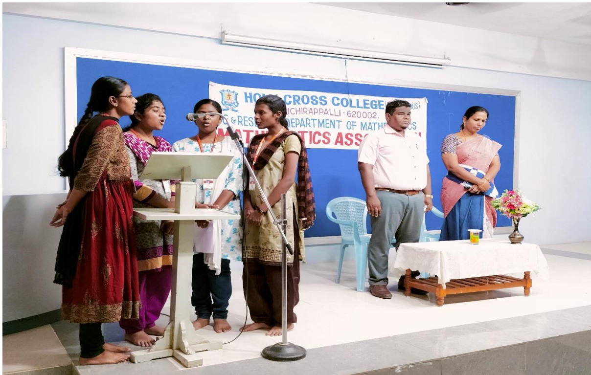
CONQUER FROM WITHIN