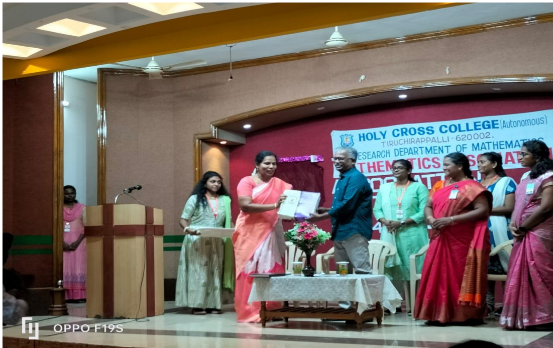
INAUGURATION OF MATHEMATICS ASSOCIATION