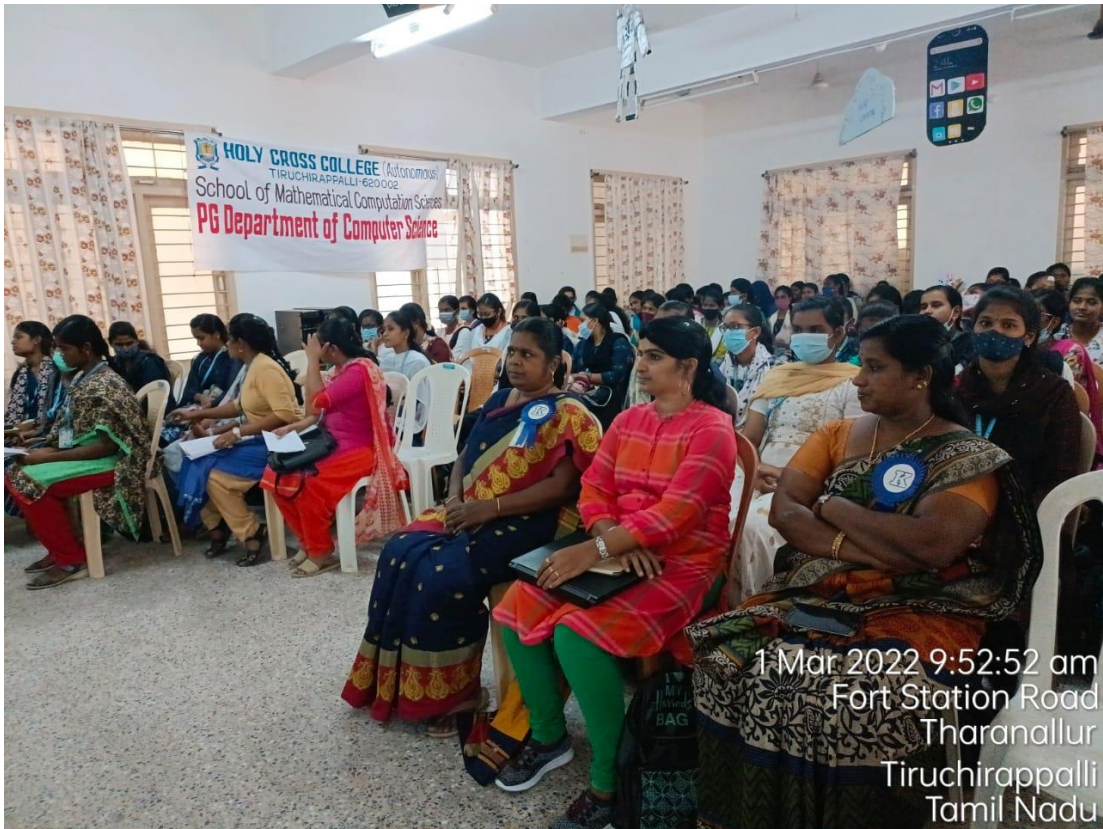
1 Mar 2022 9:52:52 am Fort Station Road Tharanallur Tiruchirappalli Tamil Nadu