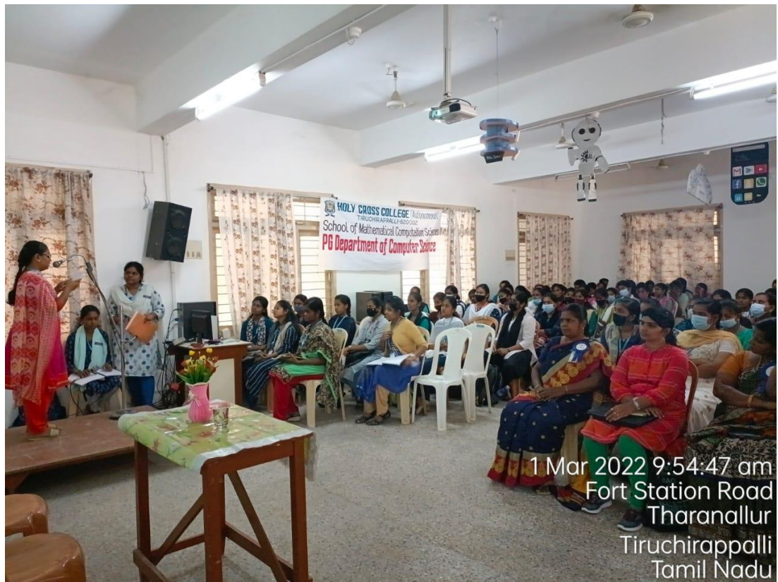
1 Mar 2022 9:54:47 am Fort Station Road Tharanallur Tiruchirappalli Tamil Nadu