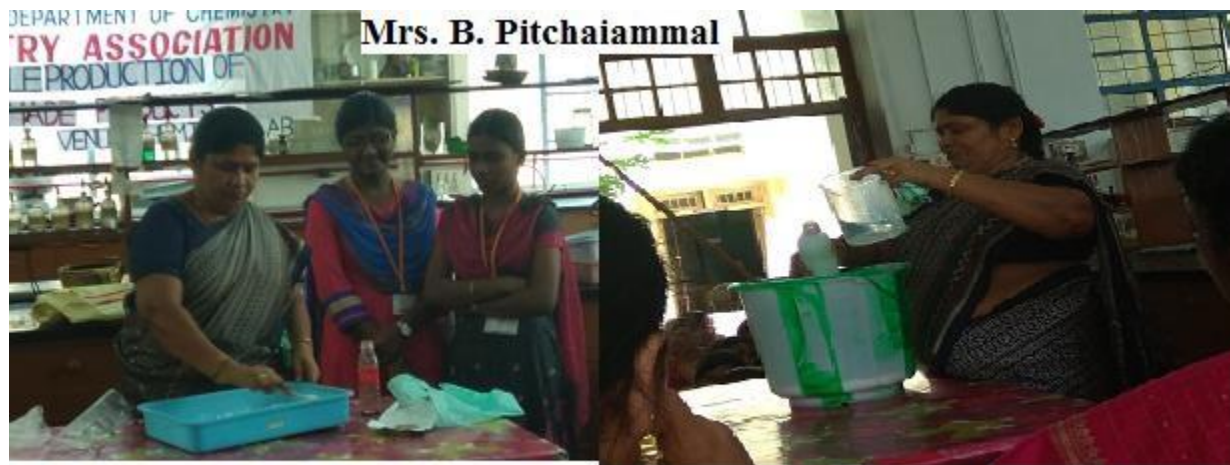
Workshop on “Small Scale production of household products” 24/10/2018