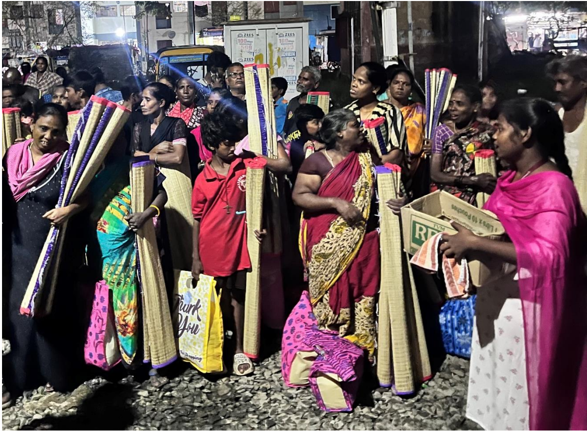
Holy Cross Emergency Relief Team distributing the relief materials for 500 affected families at Chemmanacheri