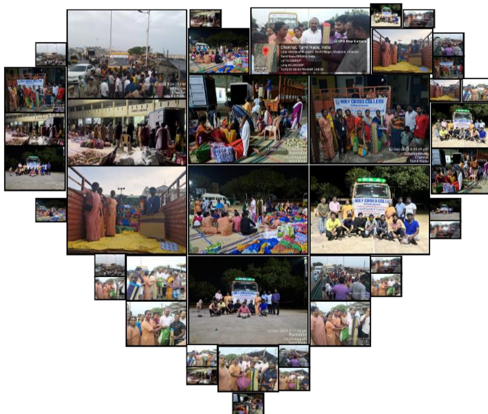
Holy Cross Emergency Relief Team distributing the relief materials for 500 families at Chemmanacher and 700 families at Pattinapakkam Fisher Folk area