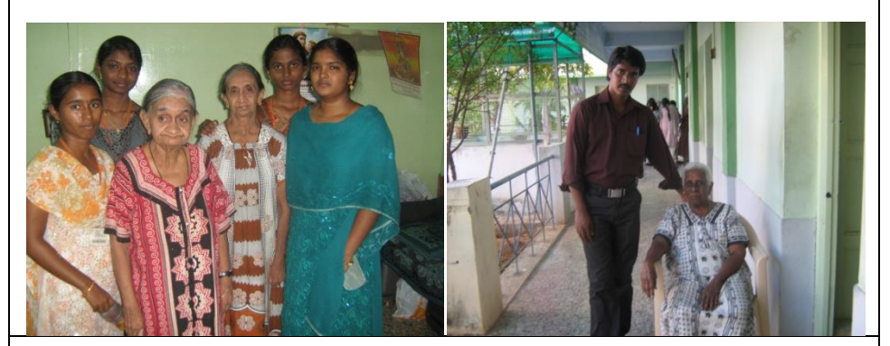
Our college students visited (Mathematics, BCA, Commerce-A & Commerce-B) OLD AGED HOME at AYIKUDI which in our adopted village.