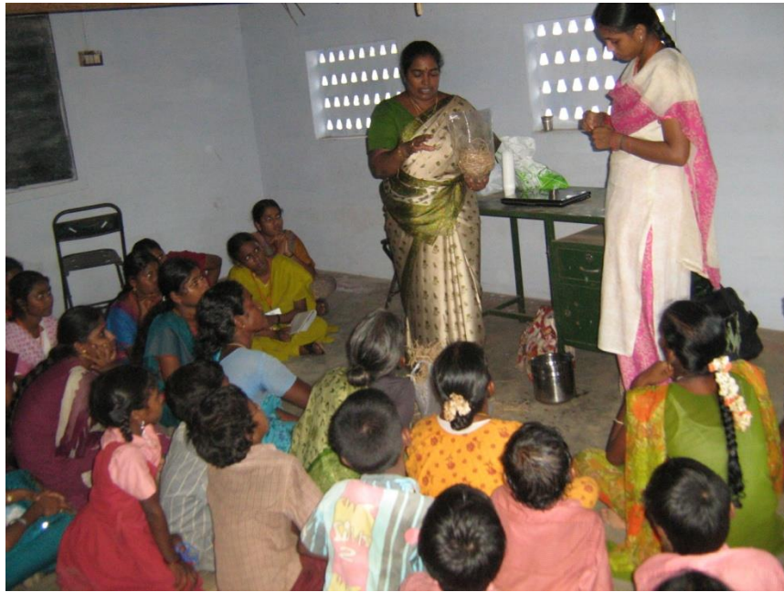
MUSHROOM CULTIVATION TRAINING

Our staff and students gave a demo on cultivation of Mushroom on a small scale level, for the village women in Salakadu (North) Manachanallur.